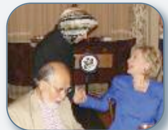
ING's President with Secretary Clinton